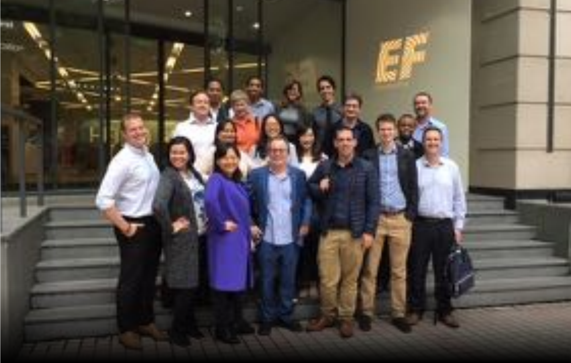
DELTM in China