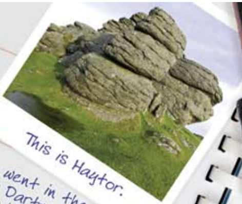
This is Haytor.

Saturday This is Haytor. We went in the Devon School bus to visit Dartmoor for the day. This first week has gone so quickly and it still hasn't rained!